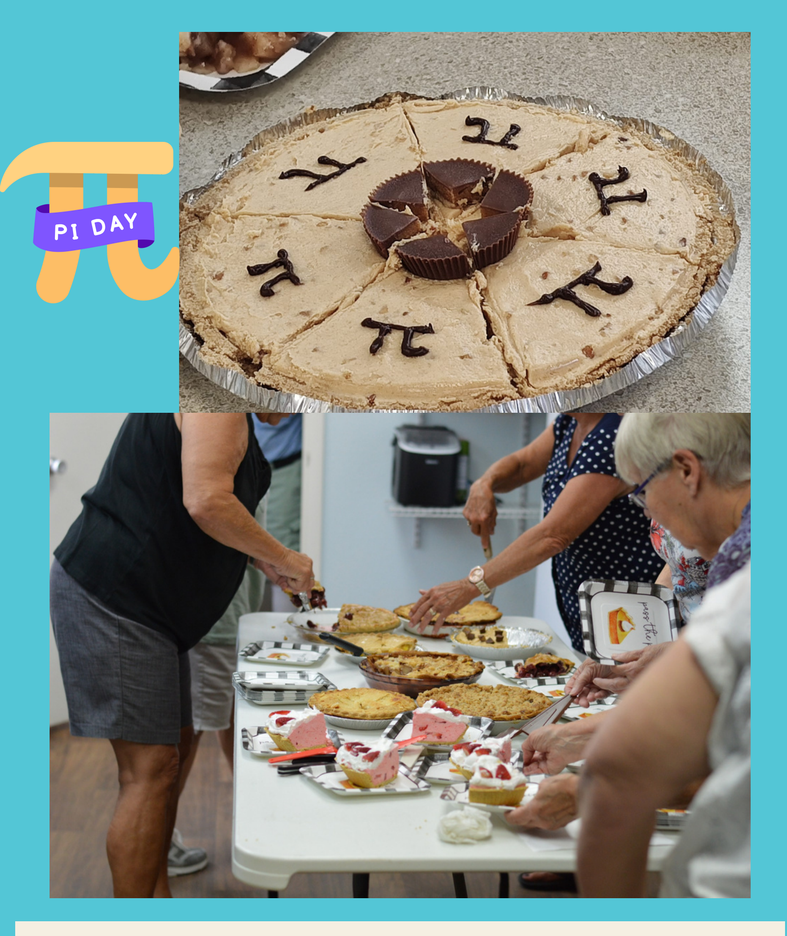
Oak Harbor RV Village, A 55+ Cove Community