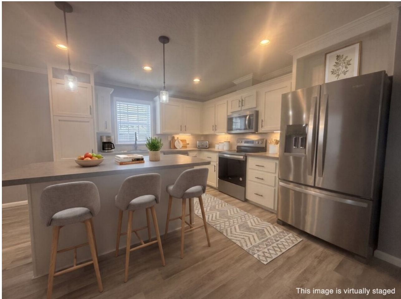
This image is virtually staged