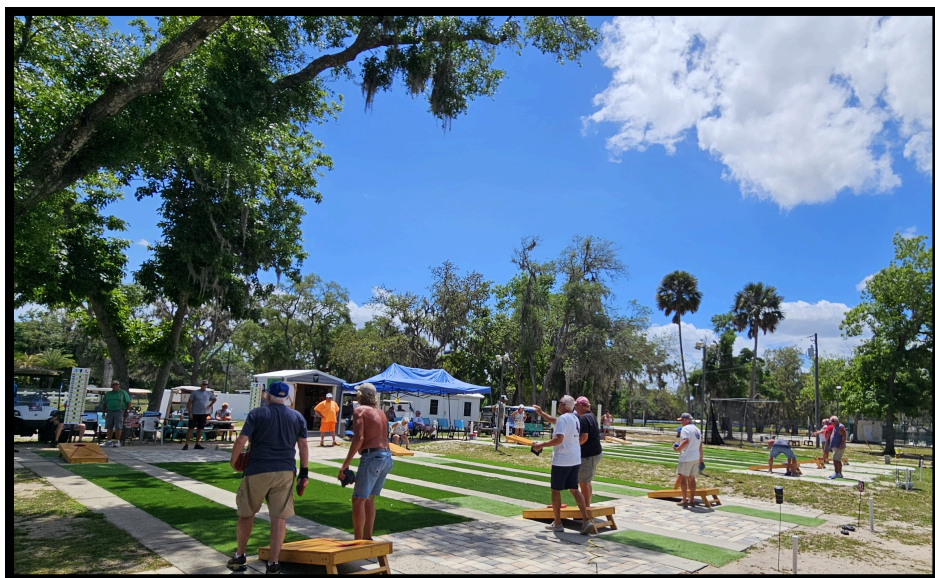
Hats off to the Cornhole players for updating their area, growing their members, and having fun all year around!