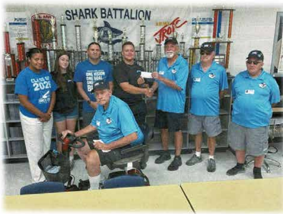
Meadows Veterans Club supporting future Veterans.

On August 8 th members of the Veterans Club visited the JROCT at Anclote High School as they begin another school year. JROCT ( Junior Reserve Officer Training ) is a high school organization that is about developing leadership, citizenship, and personal responsibility. Many of these local young men and women have plans to continue with ROTC programs in various colleges through out the country. They are on a path to serving their country as members of the US armed forces and becoming future Veterans.