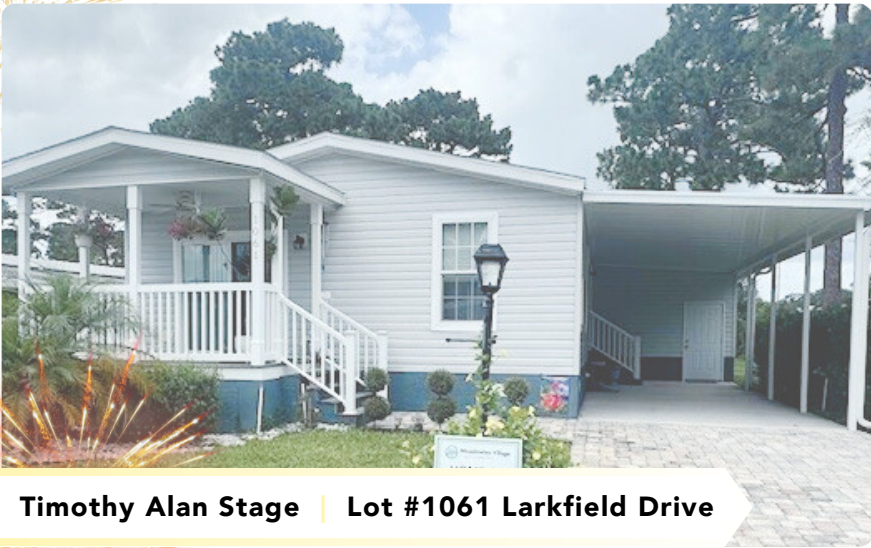
Timothy Alan Stage | Lot #1061 Larkfield Drive